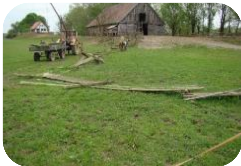
Renovation of the fence

Work on Gajna-2007-2017 Preservation of biodiversity on protected pasture Gajna by breeding original Croatian breeds —Many day-to-day activities related to animal care (feeding, health care, marking, communication with the relevant services for the purpose of records and registration of cattle, winter food provision, veterinary inspection services, ecological certification ...).