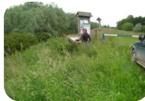
Mowing and setting up the educational path