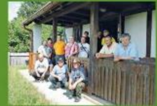
Members of the Eco-Gajna community, which is one of the 9 cases of commons in the book, are sitting on the porch of their community building.