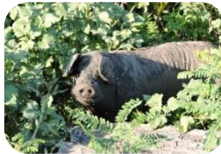
Black Slavonian pig