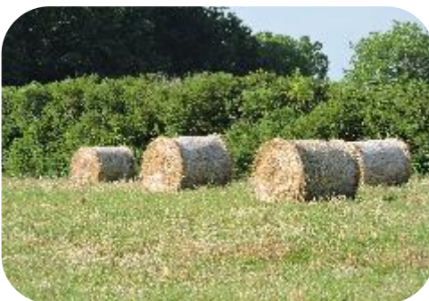
Preparation of food for the animals