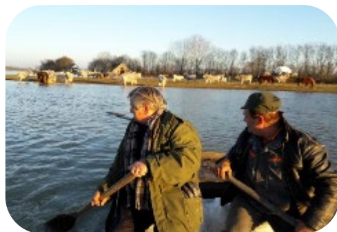
Feeding the animals during the flood