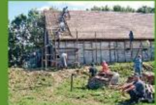
Community members in Gajna are part of a traditional pasturing community, which is one of the 9 cases of commons in the book.