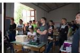
Closing EE competition ce